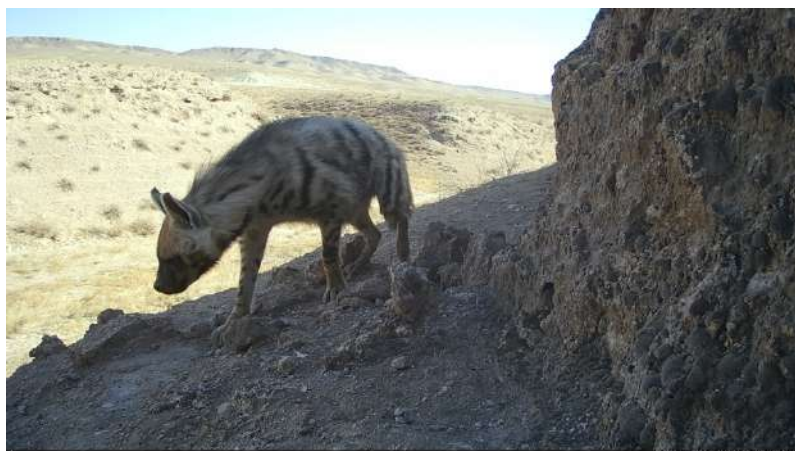
Striped Hyena in Badhyz

It has not been recorded on the Uly Balkan range or Garabogazgol. It is recorded on the Kichi Balkan range.