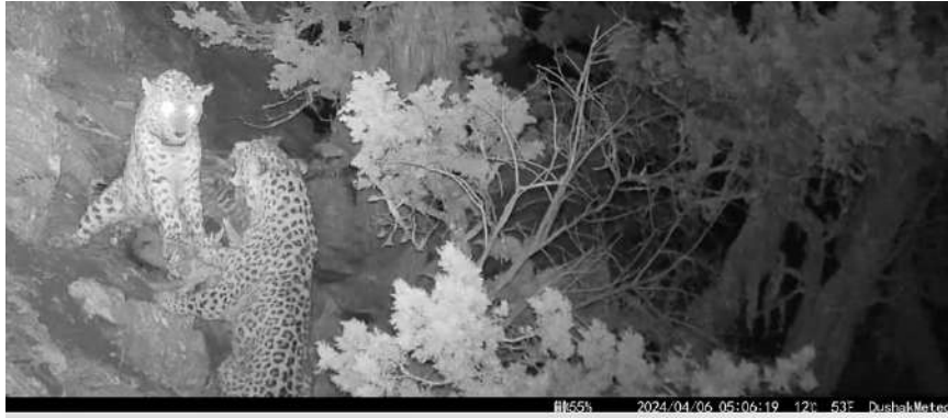
“Serdar” and “Melegush” fighting over territory, mating and food resources

In the spring of 2024, a video appeared online of a dead young leopard. Those responsible were never apprehended.