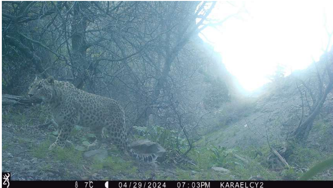
Persian leopard in Karayalchi.