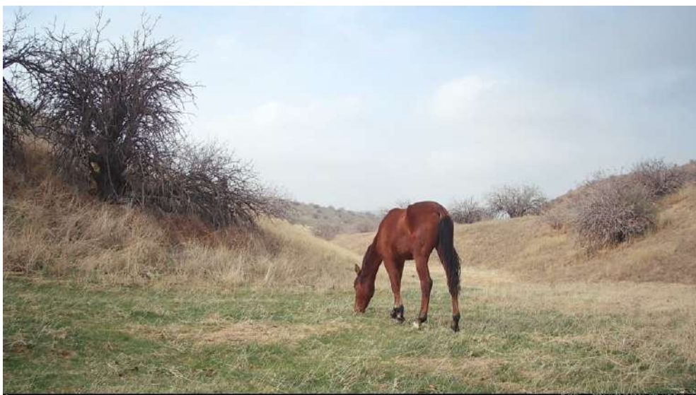
One of the feral horses inside Badhyz.

During our visit at the end of November 2024, we observed minimal wildlife activity.