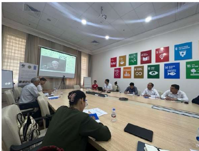
Participants during workshop

An initial and modest form of institutionalisation by the Ministry would be that Ministry staff members become involved in site protection management based on periodic SMART patrol reports. Concretely this would involve; 1) the staff from the Ministry receive the periodic reports that describe patrol efforts and results from SMART sites (or better; they get involved in the production of these reports), 2) they evaluate these reports and provide feedback to the site managers, 3) they get involved in setting patrol targets for the next reporting period, 4) they check to what extent these targets are met and follow up (e.g. they provide praise when targets are met and ask critical questions when they are not met).