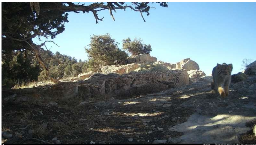
Manul on Dushak Erekdag

The installation of camera traps to record manul continues in the territory of the Kopetdag State Nature Reserve and in adjacent territories.