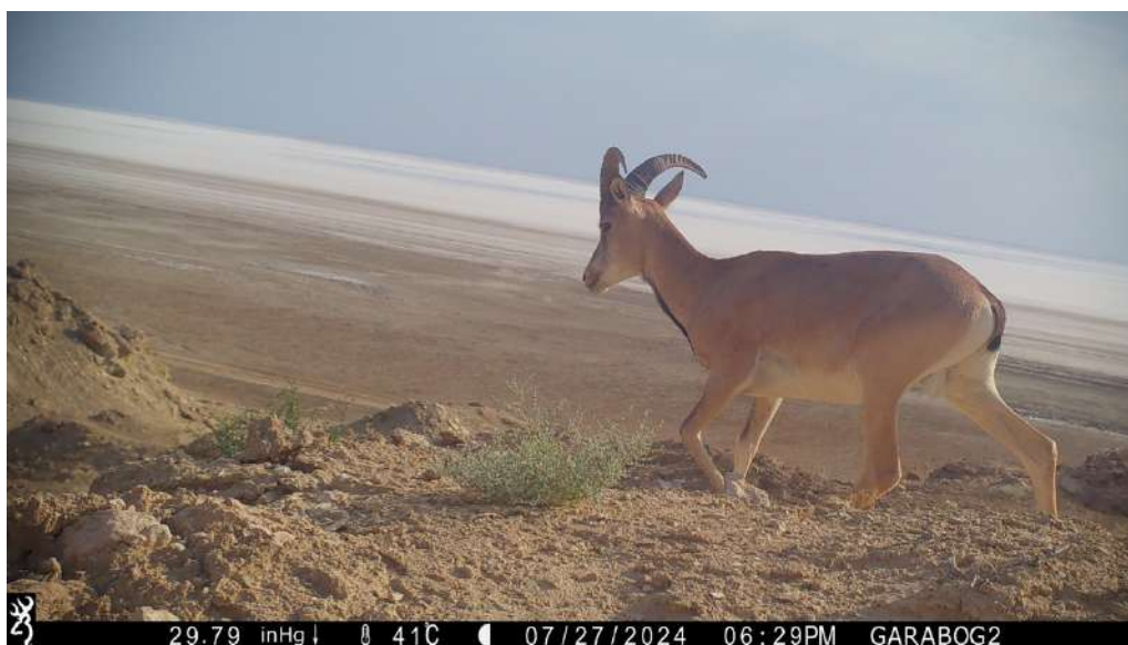
Urial on Garabogazgol

Kulan. Extinct in the wild in Badhyz, Kulan is only found in Kaplankyr to the north and west of Sarygamysh Lake on Sarygamysh part of the Reserve in the “no-man’s-land” beyond the border (4 individuals were camera trapped in 2024); these individuals seem to be continuous with a larger population of an estimated 100-150 kulan on the Uzbek side. Some 10-15 individuals were documented in the Tersakan Valley west of Sunt Hasardag Nature Reserve and 6 in the Gury Howdan Wildlife Sanctuary. None of the isolated remnants are likely to be viable. In Gury Howdan there are 9 individuals, regular protection has been established there. In 2021, after receiving a male from the zoo (from Badhyz population), 1-2 young individuals were born every year.