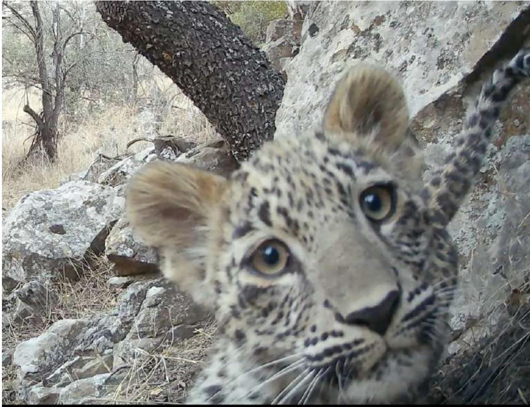
One of the leopard cubs recorded