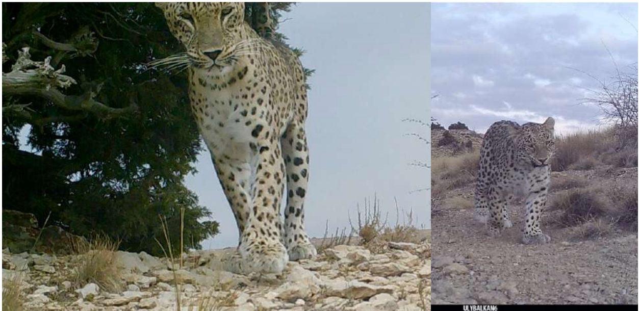
“Eziz” and “Balkan” during previous years

Of note is that we recorded at least two leopards from previous years. “Eziz” recorded in 2023, and “Balkan” recorded for the first time in 2019.