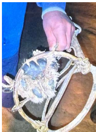
The leopard survived without the paw.

On Garabogazgol we placed 10 camera traps, but no leopards have been recorded yet. Two leopards , including one that has been caught into a leg hold snare, have been observed near the southern shore of Garabogazgol.