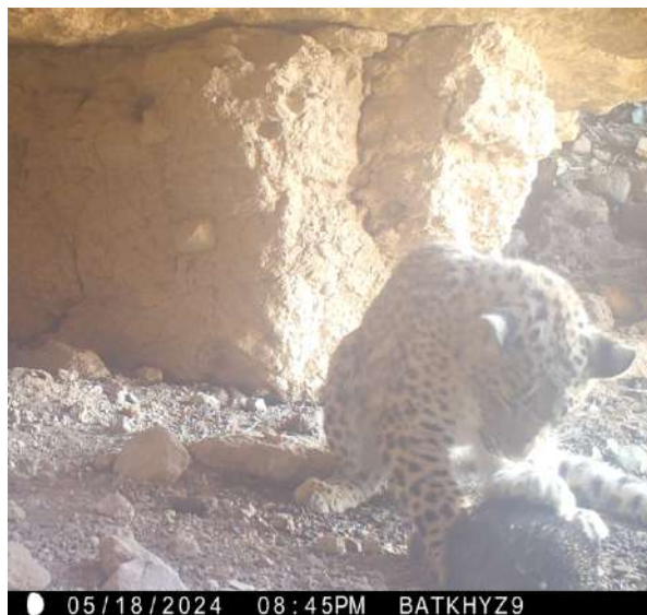
One of Umeda’s cubs playing with a hedgehog

Badhyz. In Badhyz State Nature Reserve we have observed 7 leopards in 2024 compared to 8 leopards in 2023 based on 20 camera traps placed over 800 km 2 (with gaps between clusters) for a total of 7,300 camera trap nights. Areas beyond the border fence, considered important habitat, may be home to more leopards. However, given the limited prey base in Badhyz, due to poaching pressure and habitat degradation, the carrying capacity for leopards remains somewhat limited.