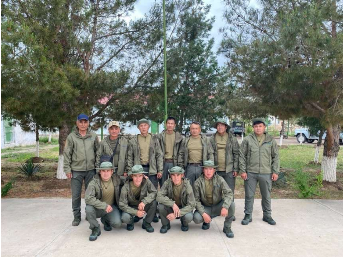
Koytendag rangers and staff with CXL outfitted uniforms

In order to achieve the 2 nd and 3 rd level of institutionalisation, the Ministry would need to establish a SMART Unit with at least 2 full-time staff members with excellent technical and management skills.