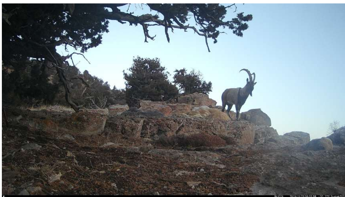
Bezoar goat on Dushak Erekdag @TeamBarsTurkmenistan

Urial sheep. Urial inhabit the same areas and ranges as bezoar goats. They are also found along the chinks of Garabogazgol, in Badhyz, Sunt Hasardag, Kopetdag and in Koytendag. They are also under poaching pressure, and unlike bezoar goats that have escape routes on the cliffs, urial tend to have fewer options that make them more vulnerable to poaching. They are especially under threat on Garabogazgol, where they are easily killed when they approach the limited water holes. On Dushak Erekdag the population has declined by more than 50% compared to data from 2019.