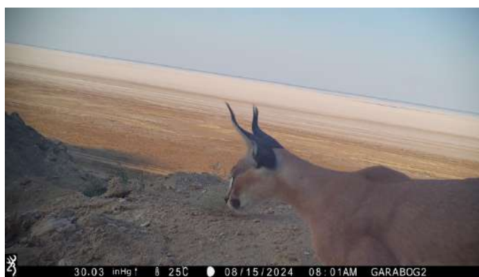
Caracal on Garabogazgol

Caracal. A caracal was recorded on camera trap in Kaplankyr in 2024 and on Garabogazgol: an individual in Kyzyl Gup near the southern shore; a female with a kitten on the eastern shore; and another individual near the northern shore. The records from Garabogazgol are exceptional and reinforce the decision to set aside as protected this landscape.